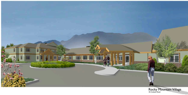
Rocky Mountain Village 39 Cochrane Road