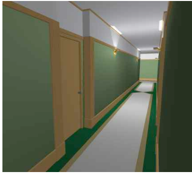
Hall treatment study (ArchiCAD)