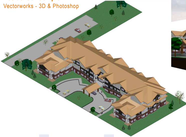
Residential Complex Vectorworks - 3D & Photoshop