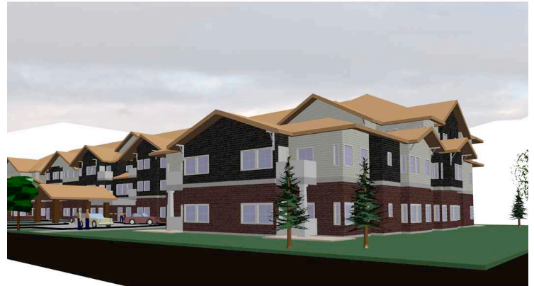
Residential Complex Vectorworks - 3D & Photoshop