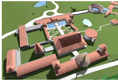
Temple & Conference (Canada) (Vectorworks & Cinema 4D-XL)