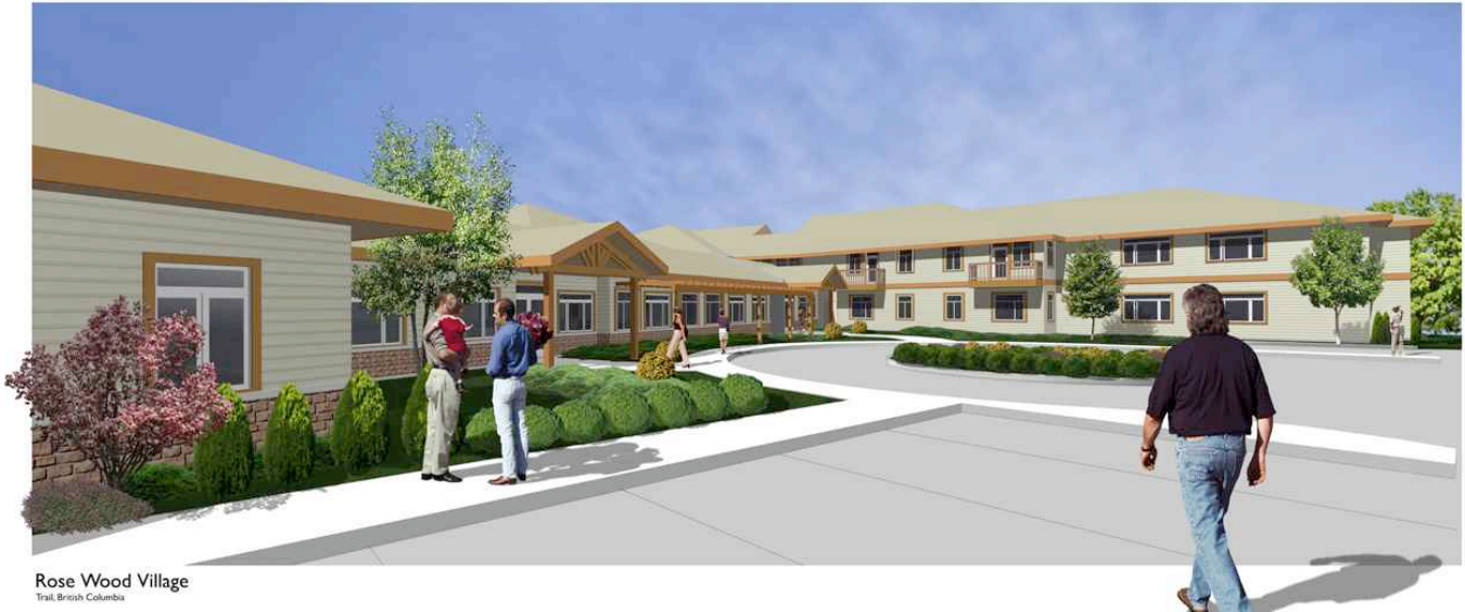
Rose Wood Village Trail, British Columbia