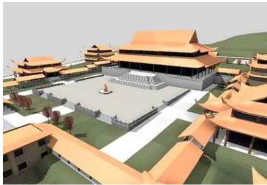
Temple complex (USA) (Vectorworks & Cinema 4D-XL)

perspective View The Number 14 Set (New Bus)